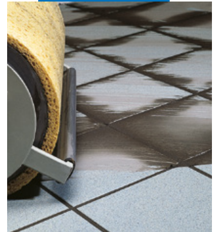
Floor finishing with a machine