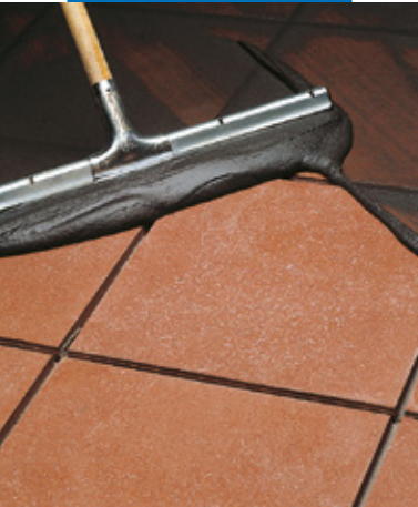
Grouting a terracotta tile floor with float