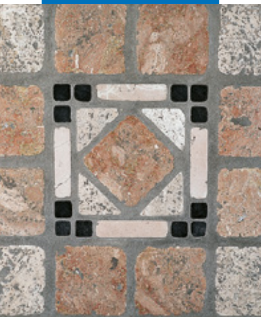
An example of a grouted antique marble stone floor