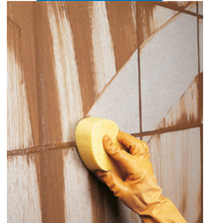
Wall finishing with a sponge

Our Commitment To The Environment MAPEI products assist Project Designers and Contractors create innovative LEED (The Leadership in Energy and Environmental Design) certified projects, in compliance with the U.S. Green Building Council.