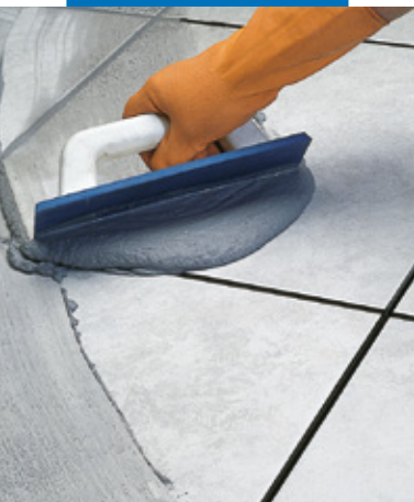
Grouting a ceramic tile floor with a sponge trowel